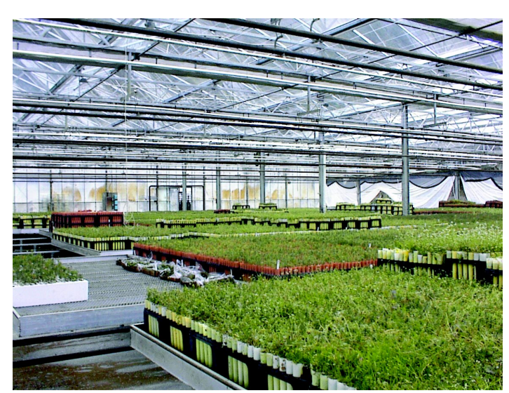
Greenhouse at the Tsemeta Regeneration Complex filled with Douglas fir seedlings ready to be planted back into forests.

High-energy costs were a real motivator for the Hoopa Valley Tribe. Before the biomass unit arrived, it was paying 13.9 cents per kWh to heat the greenhouse facility, adding up to about $7,000 per month in fuel bills. The tribe